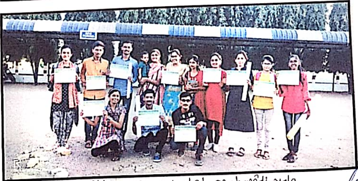
poster competition at Venkatesh Mahavidyalaya, Devulgaon Raja.

PRINCIPAL Nutan Mahavidyal SELU, Dist. Parbh